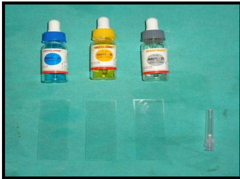
Figure 1: Antisera Kit.